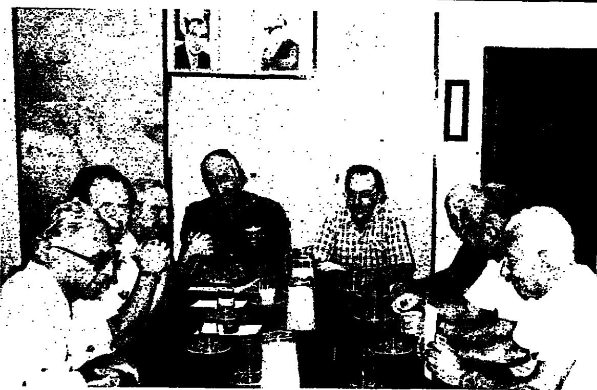
Chief of Staff Moshe Levy and Defence Minister Moshe Arens meet on Friday with Israel's former chiefs of staff at the minister's office. Left to right are Zvi Tsur, Mordechai Gur, Rafael Eitan, Levy, Arens, Yigal Yadin, Yitzhak Rabin and Haim Bar-Lev. They discussed current security problems and the situation in Lebanon.

The Syrian government daily Tishrin continued to attack Arafat yesterday, particularly his attempt to cast the blame for what was happening inside Fatah on Damascus. (Continued on Page 2, Col. 1)